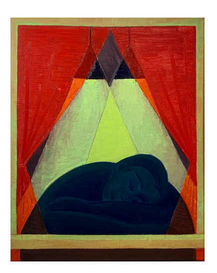
Figure In Window, 2022 Oil on panel NFS, 20"x16"x1"