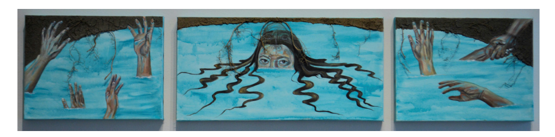
Saakiiweeyonki (Coming Out Place, The Confluence), 2022 Acrylic paint, mud, and roots NFS, Triptych: left and right panels -12 x 16 x 1.75 inches; middle panel - 12 x 24 x 1.75 inches