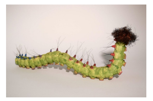
Call of the Caterpillars, 2021 Ceramic, Horse Hair, and Music Performance Video NFS, 7.5" X 3" X 18"

My work reflects a site-specific and ceramic performance-based visual and auditorial installation. It focuses on the unity of nature themed utilitarian ceramic instruments and its sound production that affects the natural acoustic environment in which it thrives. The idea of Mother Earth and the music she sings is long forgotten and now unnoticeable through the distracting technologic matrix we consume daily. I have paired with her to showcase the beauty of the inner workings of the Earth to a zombified audience. In exchange, she cradles me through the self-doubt of my own inner thoughts and towards a path of emotional healing away from social media. Creating nature inspired instruments, composing the appropriate arrangement for each piece, and recording a site-specific performance on the stage of Mother Nature's home accentuates this bond between her and I. With this collaboration, Mother Nature and I are both willing to share this motherly connection we have that is desired to be visually and auditorily engaging. We want to bring awareness to help limit future actions towards the negative impact that is brought upon by consumerism.