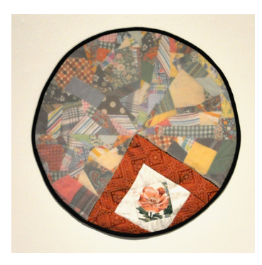
Unwillingly Wasted Time, 2022 Found fabric, Acorn-dyed silk, Wreath frame NFS, 2', 2', 1"

A large portion of my time is spent stuck knowing a list of tasks I should work on, but not knowing which, or how to get myself to focus on them. With my knowledge of obligations and potential, this creates shame, frustration, and confusion. Others reassure me about what I'm doing, and the accomplishments I've completed, but their compassion doesn't change my perspective. This quilt utilizes the circle as the shape of cycles. The majority of my time disappears in ways that feel useless. What I share with the public feels deceptively non representative of how my time is spent.