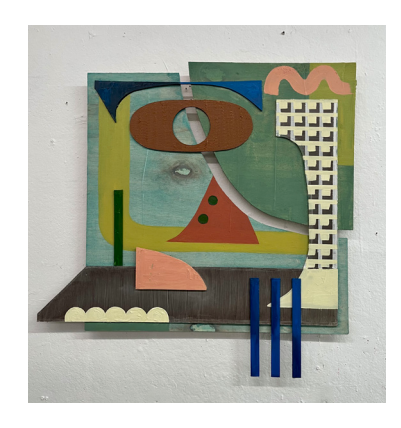
Some Place Outta There, 2022 Oil on birch & masonite NFS, 28" x 28.5" (1.125 Depth)

Each night following a Yoga Nidra meditation, I would experience visions when first closing my eyes. I would see people, places, and compositions I had never thought of or seen before. These images quickly became present in my art practice. I began to translate these hypnagogic scenes into my paintings using a combination of color pallets derived from my studies of color theory, and other themes found in architecture from the 1960's Space Age era.