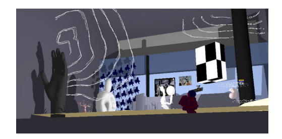
You Ask if I am Dancing, 2022 3D sculpted translation of 2D AI composition generated from my journal entries NFS, 1min 40sec video

This body is full of contradictions, ambiguity and at its core, double meaning. Both things are true: There is form and anti-form The work is full of meaning but there is space for a lack of meaning, intangibility and tangibility as well as performative and non-performative action. I create by mediating the experience of living in a body with chronic pain disorder. This work is a message in a bottle to connect with viewers through a framework of both ephemerality of experience and the tangibility of abstracted work in space. As a way to process feeling, I generate artificial intelligence compositions from the text of my journal entries. From that generated sketch, I reflect upon the tangibility of experience within another mode of materialized ephemerality that is animation and 3D sculpting. Allowing me to correspond with words which at times hinder authentic communication. Materializing is a way of dematerializing constrictions of language.